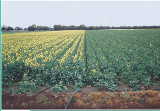
Figure 3 Early-maturing varieties (left) suit later sowings (early to mid May) and mid-maturing varieties are suited to earlier sowings (late April to early May), to ensure flowering and pod-fill occur at the most suitable times of the season