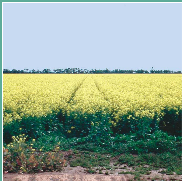
Figure 2 Canola grown on border check (left) can yield 85–90% of canola grown on raised beds (right) with good irrigation layout and careful management