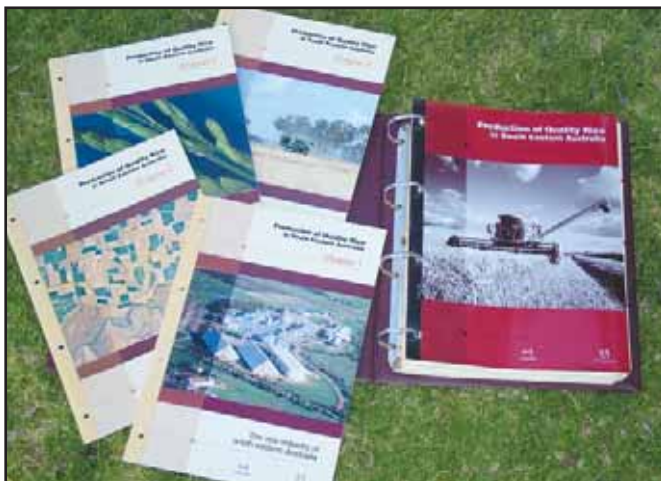
Figure 2: Each chapter of the publication contains the most up-to-date information and science, and has been written by experts in the topic.