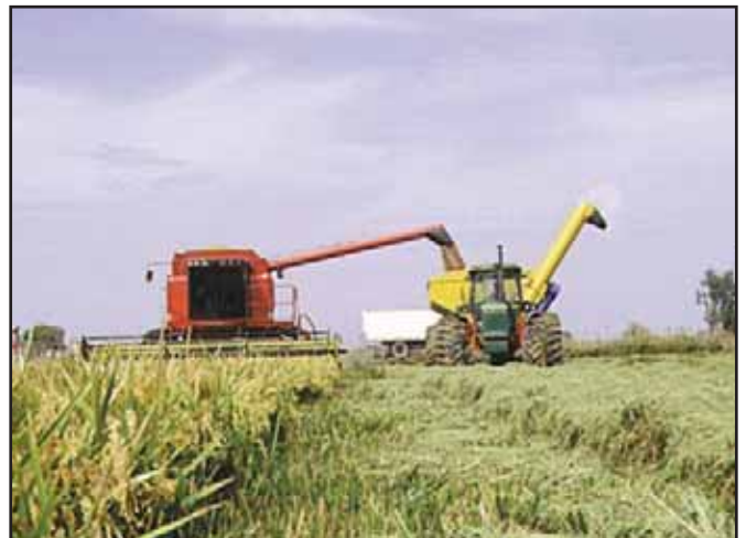
Figure 5: The publication strives to explain the WHYs of rice growing, complementing the HOW TOs of other publications and extension programs.