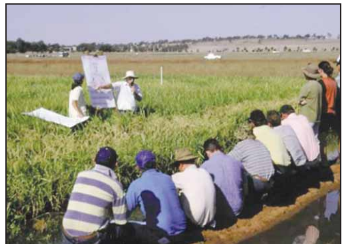
Figure 3: The publication is based on the experience and knowledge of researchers and growers in the Australian rice industry.