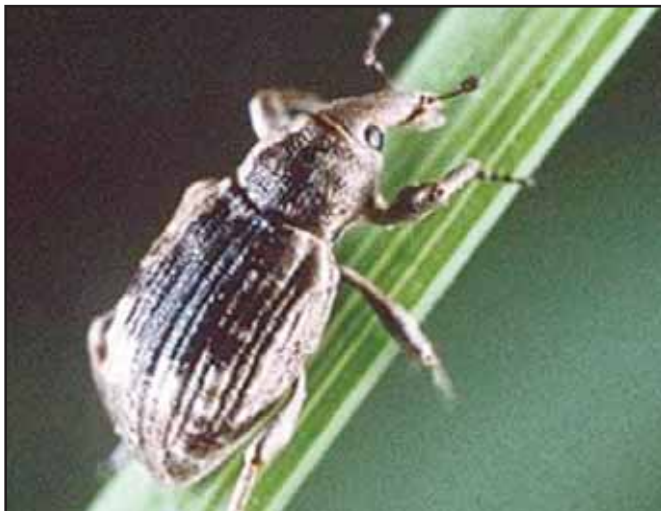
Figure 4: A comprehensive collection of weed, pest and disease photos has been collated for the publication.