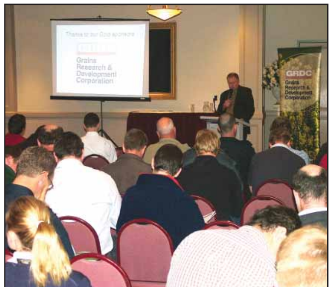
Figure 2: The Murrumbidgee/Lachlan GRDC Irrigation Update was attended by around 130 people, with growers and service providers presented with cutting edge information on irrigated crop production.