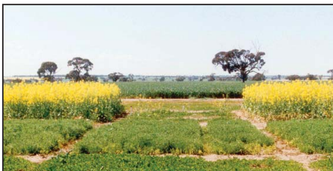
Figure 1: Herbicide residues persist beyond plantback periods after dry seasons. Spinnaker residue damage to canola one year after application (centre plot) at Kaniva, Vic. The outer plots were not sprayed as a comparison.