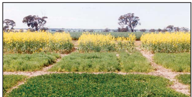
Figure 2: In this situation, herbicide residues were affecting the new crop, two years after application. Spinnaker residue damage to canola two years after application (centre plot), at the same site and plots as in Figure 1.