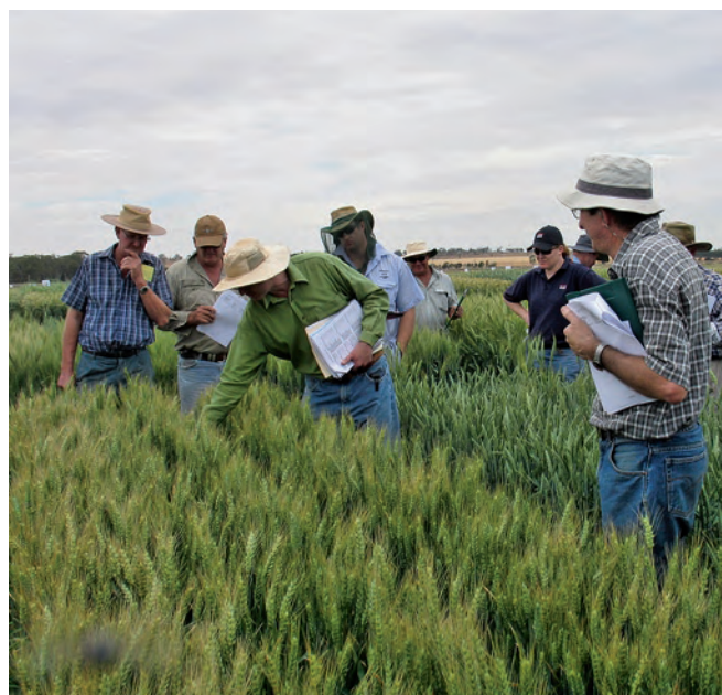
Figure 1. The 'winter cereals for irrigation' trials have shown many current varieties and breeders' lines yielding close to and above 10 t/ha

The management of the trials was based on the crop checks developed for the '8 tonne club' by John Lacy and modified for achieving 10 t/ha. The nitrogen budget and timing of irrigations were critical to achieving our results.