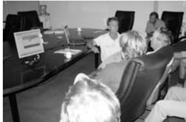
SMP scheduling – group training session

SMPs have been steadily acquired since summer 2007/08, with nearly the entire total of seventy currently in active service. They have been deployed in over one hundred & twenty installations on both irrigators' farms & the Coleambally Community Experimental Demonstration Farm.