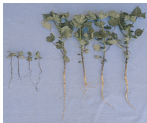
The growth difference between healthy plants (right) vs plants infected with Black root rot (left). The plants on the left are also expressing symptoms of Black root rot through the black tap and lateral roots.

Black root rot delays development of the crop and in effect 'steals time' from the crop. If conditions later in the season are warm then the crop may not compensate and yield well. Severe Black root rot can lead to delays in maturity of up to four weeks and yield reductions as high as 40 per cent.