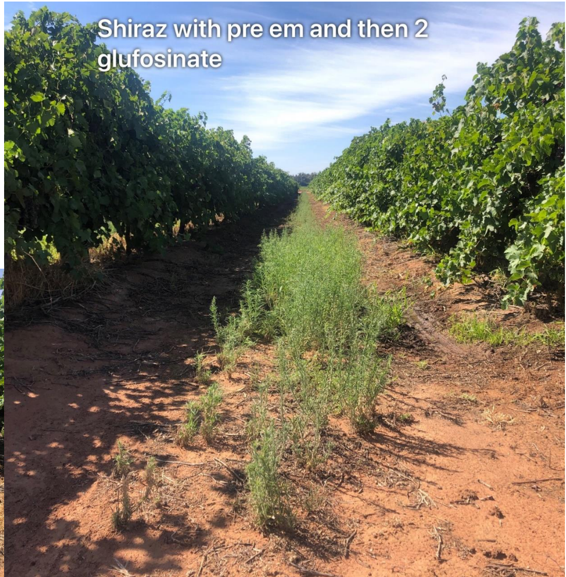
Shiraz with pre em and then 2 glufosinate