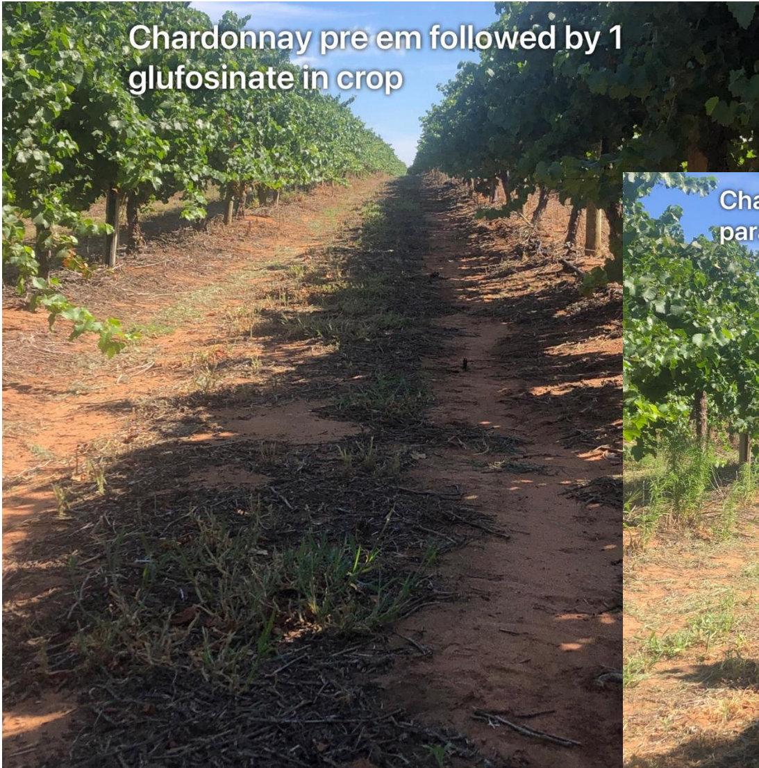
Chardonnay pre em followed by 1 glufosinate in crop