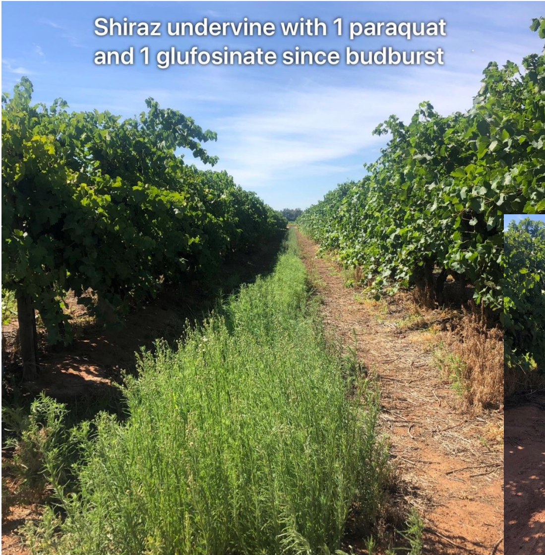
Shiraz undervine with 1 paraquat and 1 glufosinate since budburst