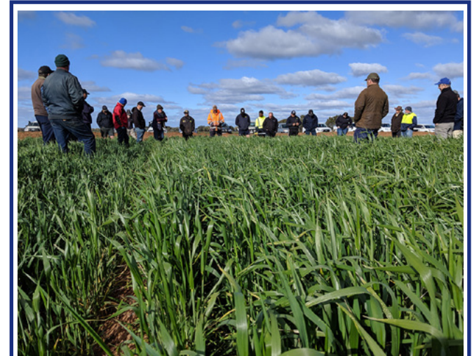
Field walks and discussion group meetings are at the centre of IREC activities. They are a vital way for farmers and advisors to learn and keep up to date with crop production options, practices and management.

Congratulations Rob on a very well-deserved award!