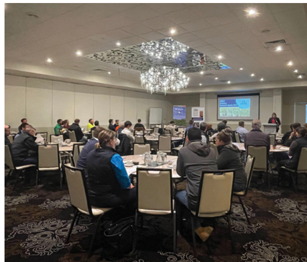
50 farmers, advisors and industry representatives attended the IREC Irrigation Research Update in July.

The update booklet is available from the IREC Website for those who missed out.